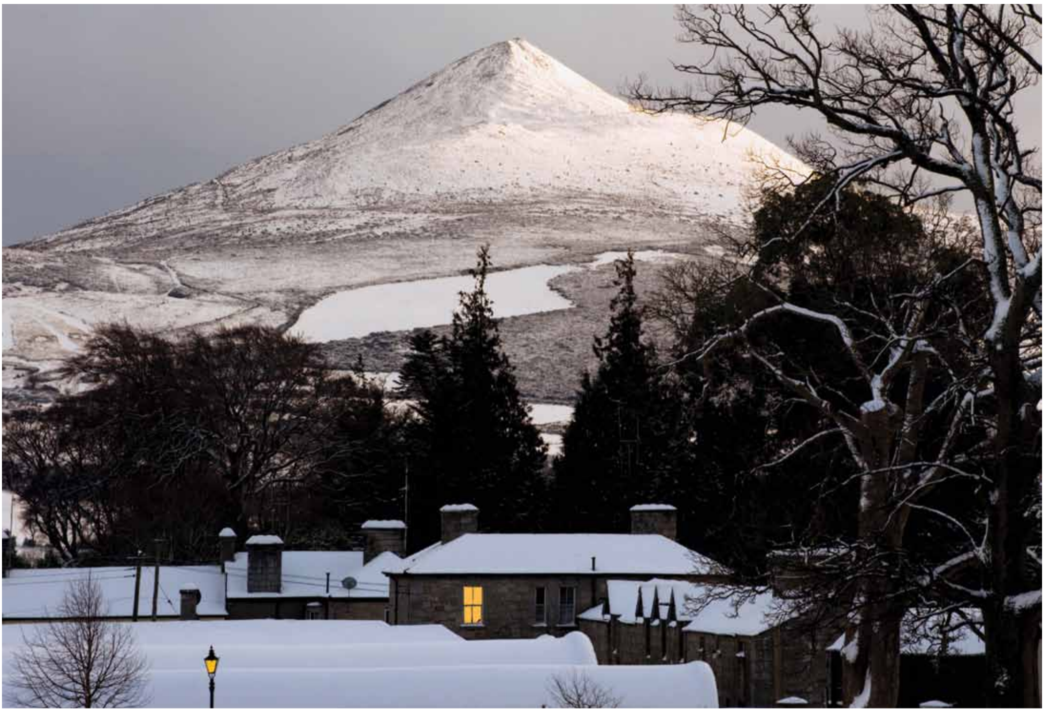
Great Sugar Loaf from Powerscourt