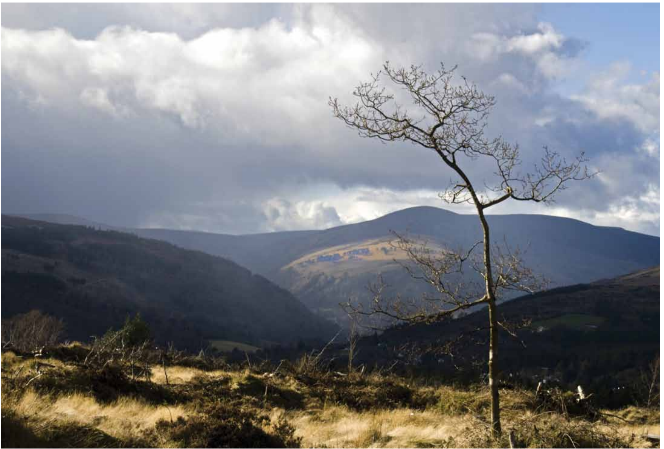
Camaderry from Trooperstown