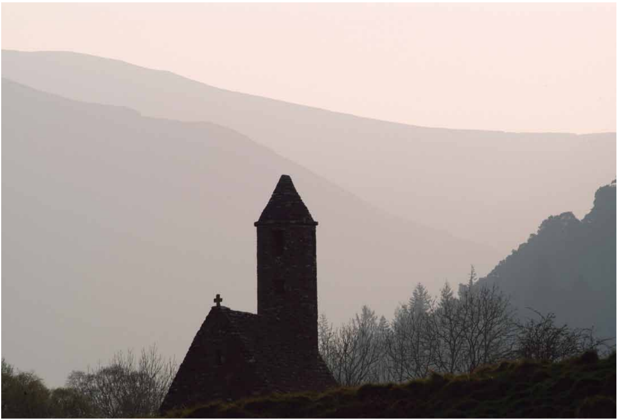
St. Kevin's Kitchen, Glendalough