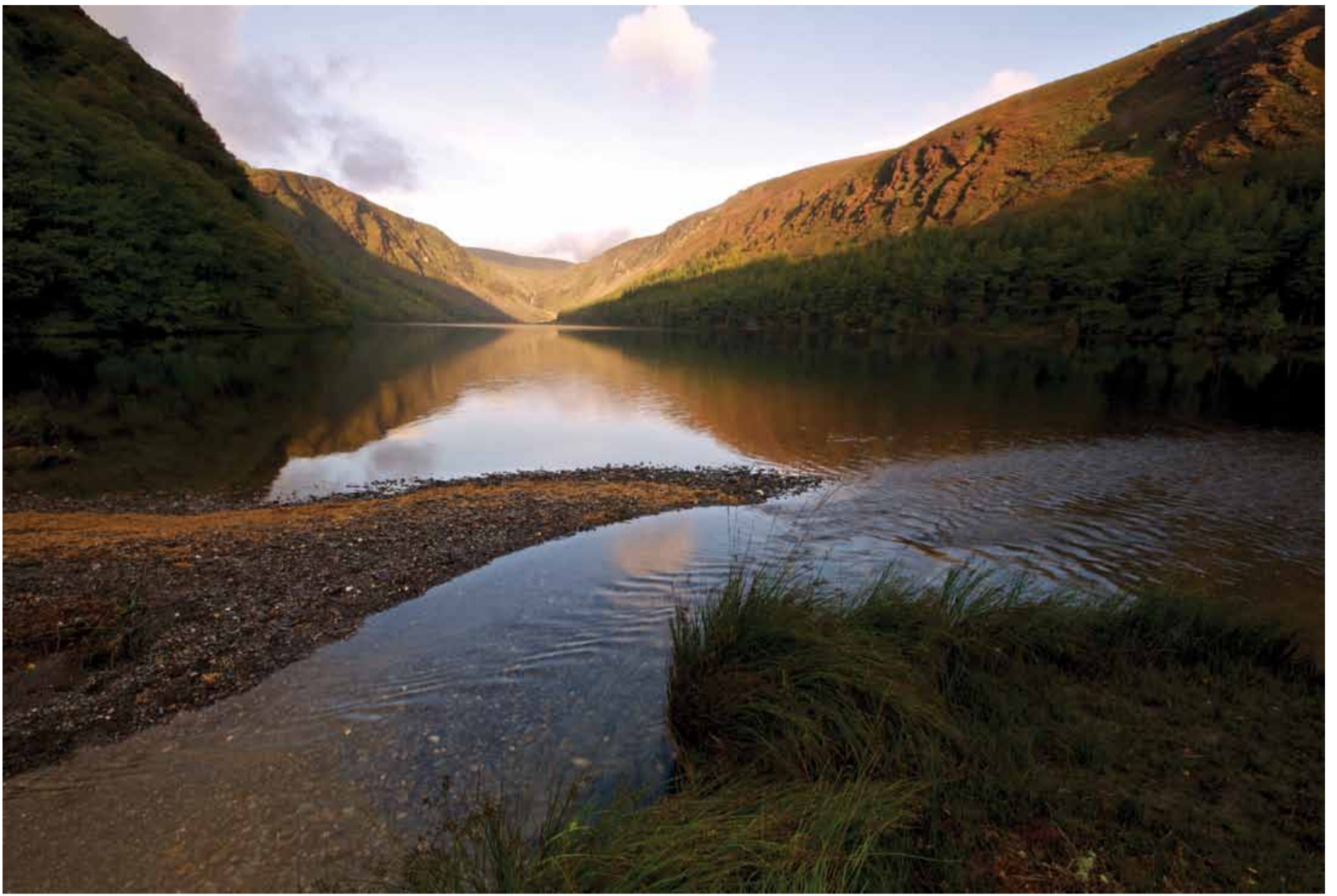
Upper Lake Glendalough