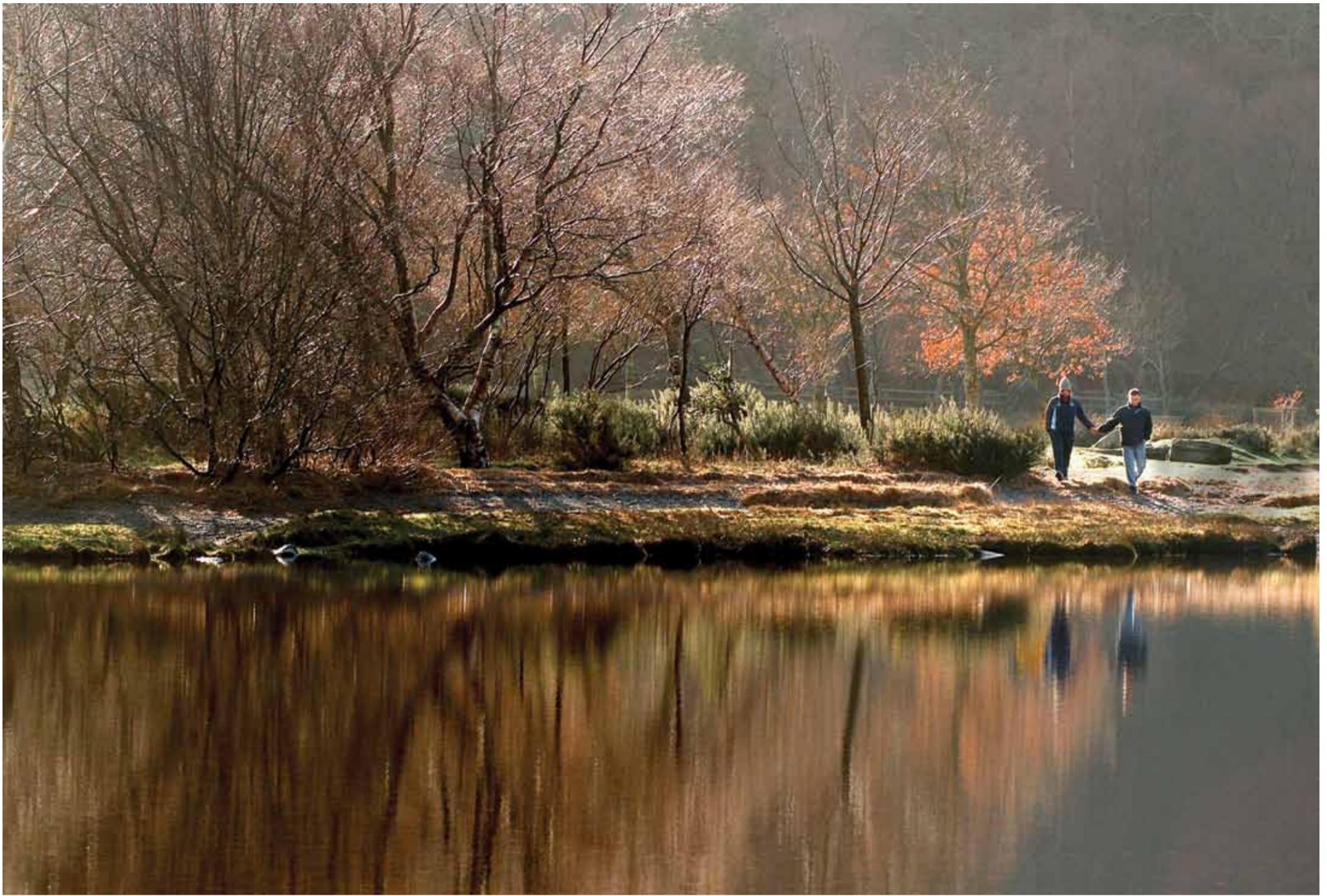
Early Morning Glendalough