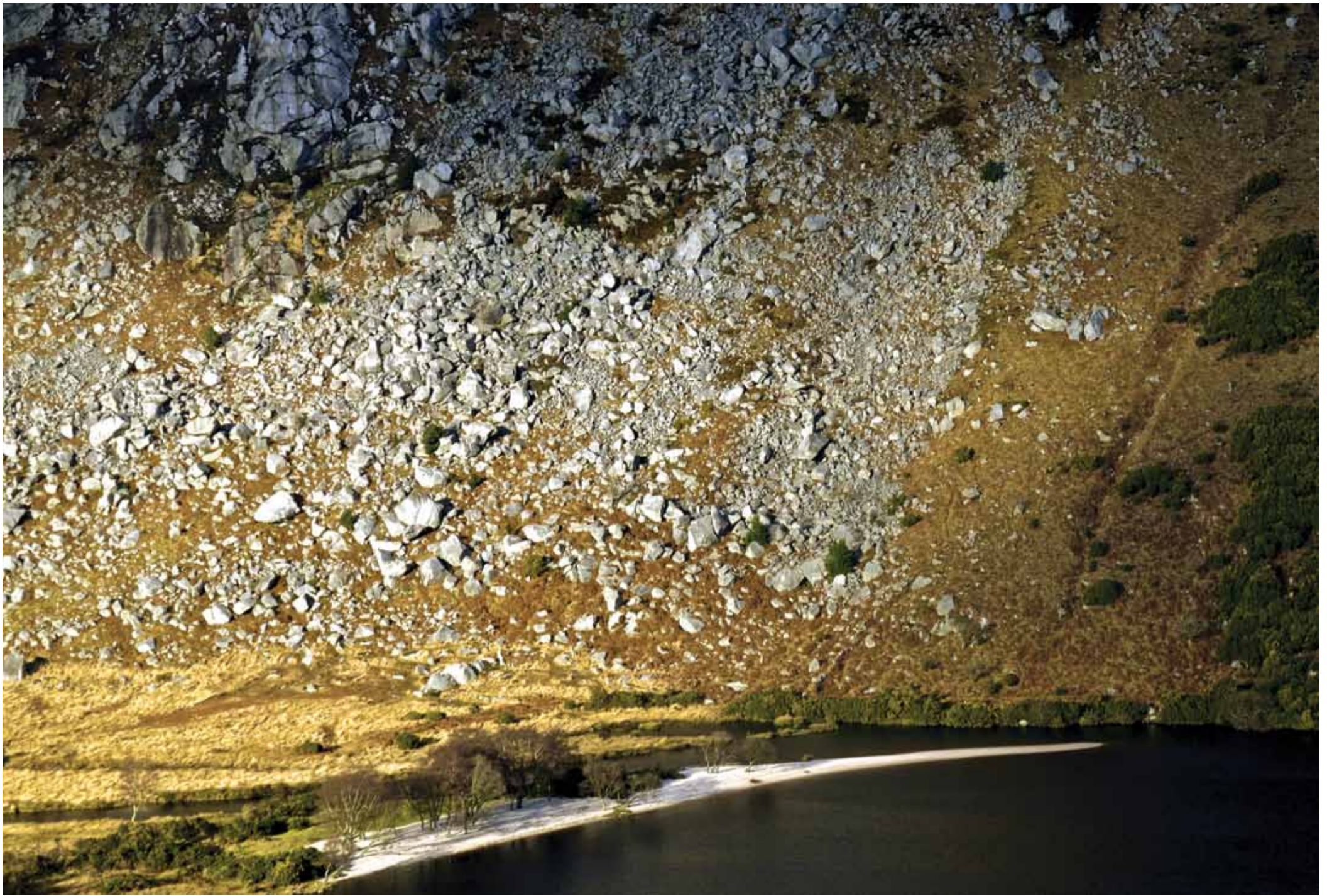
Inchavore Beach, Lough Dan